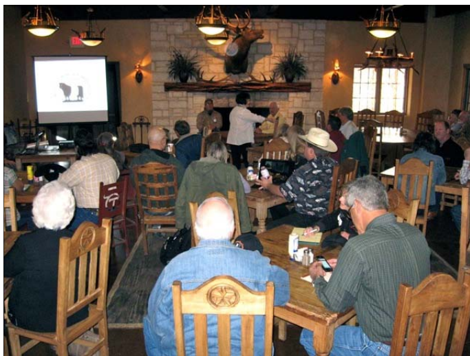
Circle T Resort. Beltie enthusiasts enjoyed the Saturday training and meeting.